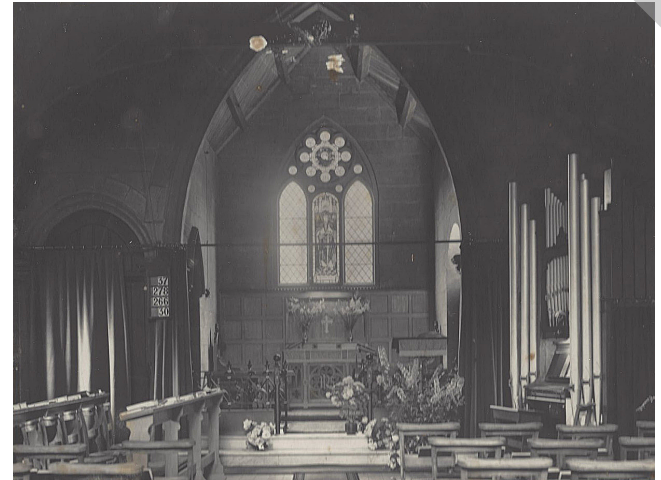
St Paul's Church in the 1930s

Things moved fast, and on 31 March 1911 the Church Room was dedicated by the Bishop of Islington. It was not until 1936 that the Church Room came to be called 'St Paul's Church'. In the early days it was only a part-time church. It was furnished with chairs (one or two still survive) and the chancel could be screened off by drawing a large red curtain across it. During the 1914-1918 war, the Church Room served as a canteen and recreation room for servicemen stationed in Hadley Wood, and was also used for lectures and evening meetings. It seems that only evening services were held there until 1923, when regular morning services were added.