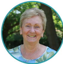
Sally Sloan Council