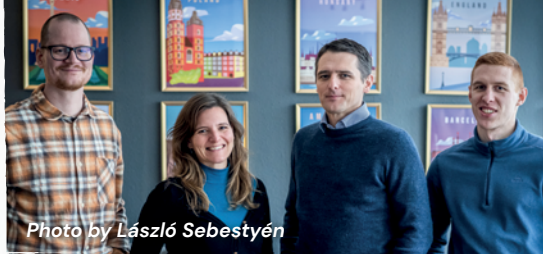
↑ Team photo for Reformed Church Website interview