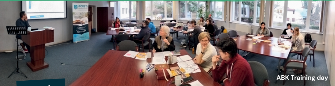
ABK Training day

Summer 2024 If you are interested in bringing a team out from your church next year to partner with a Hungarian church and run a youth camp please get in touch with Sam & Tirca ( camps@acorn.hu ).