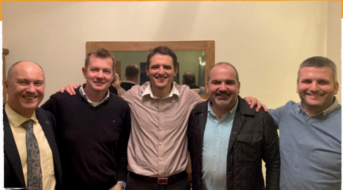
The new Hungarian Board ↑

Acorn Alapítvány – when we can praise God for his faithfulness in the past and recommit the work into his hands as it begins a new chapter.