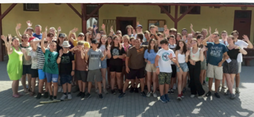
Tahi camp 2022 ↑